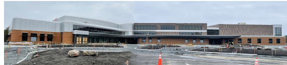
State-of-the-art facilities, Dennis-Yarmouth Intermediate Middle School